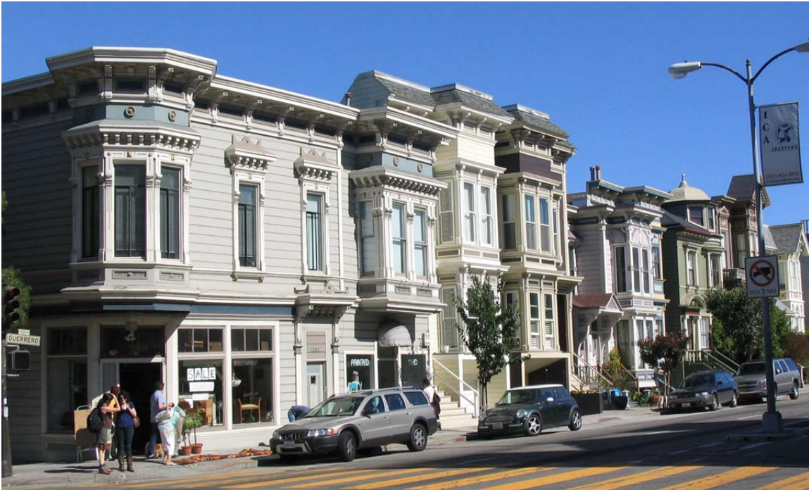
East side of Guerrero Street south of 24 th Street.

Boundaries: East side of Guerrero Street between 22 nd and 25 th Streets, as well as portions of blocks to the east